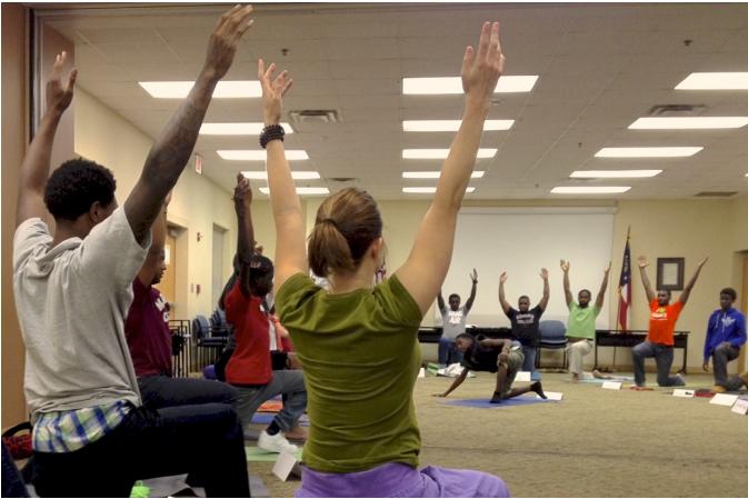
TLC students stretch as part of a yoga exercise during a Saturday meeting at Fulton County Juvenile Court.